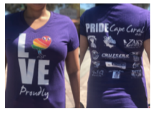
Front & back of 2020 sponsored shirt (women's v-neck)