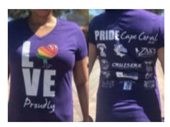
Front & back of 2020 sponsored shirt (women's v-neck)